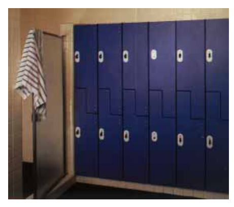
Shower and locker installation. Lockers are available in an almost infinite array of types and sizes. "DesignRite solid phenolic lockers are pictured here.

Retrofitting restrooms or other areas with existing plumbing usually represents the most cost effective way of installing locker/shower rooms. A number of regulatory issues, including compliance with building codes and the ADA