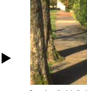
Recent medical studies indicate that as little as 30 minutes a day of brisk walking is enough to maintain optimal health.

Once installed, locker and shower rooms can also be used to support inhouse company sponsored exercise programs.