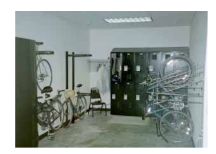
The Port of Portland's retrofit of an existing employee bike parking bom doubled the amount of rack space and added shelving, changing areas and clothing hooks. Clothing lockers were provided as part of the original installation.

Providing adequate clearances for maneuvering and parking bikes is critical. Manufacturers' suggested minimums are sometimes unworkable in practice. Careful layout and testing of proposed rack locations is advised before permanent installation. See Issue Paper #1 for more information on selecting and installing racks.